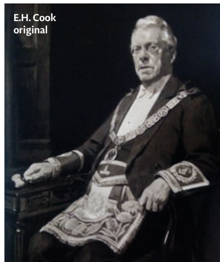
E.H. Cook original