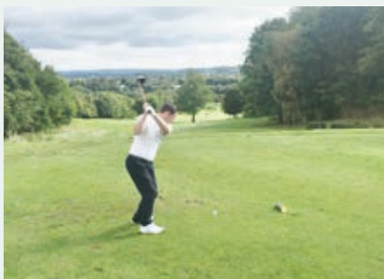
The Ron Brunton Inter Lodge Trophy Played at Thornbury Golf Club Friday 15th September 2017

O n what was to prove an overcast, but warm day, 20 players from 9 lodges from within the Province of Bristol competed for the coveted Ron Brunton Inter Lodge Golf Trophy – the third year that this competition had been held.