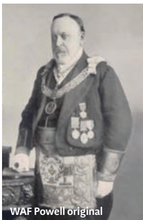
WAF Powell original